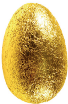
At the end of the day, it's the employee that lays the golden eggs.

At the end of the day, it’s the employee that lays the golden eggs, by producing solutions to technical challenges, fixing customer issues, coming with innovative ideas and generating IP that helps to stay in front of competition. So, learning and upgrading their skills makes business sense. ■